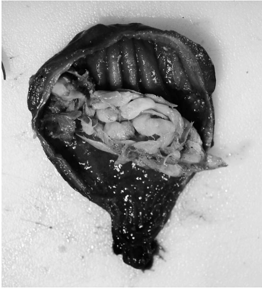
FIGURE 3. Mole crabs ( Emerita analoga ) discovered during necropsy in the stomach of a Gull-billed Tern ( Gelochelidon nilotica ) recovered during the 2013 mortality in San Diego Bay, California, USA. Digestion rates suggested mole crabs were consumed within 24 h before death of the bird.

infection ( n=29 ). In the jejunum and ileum combined, the number of parasites ranged from 3 parasites/cm to 22 parasites/cm 2 (mean=7.4, SD=3.2). Voucher specimens of acanthocephalans were deposited at the Sam Noble Oklahoma Museum of Natural History (catalog nos. OMNH-217001, OMNH-217002, OMNH-217003).